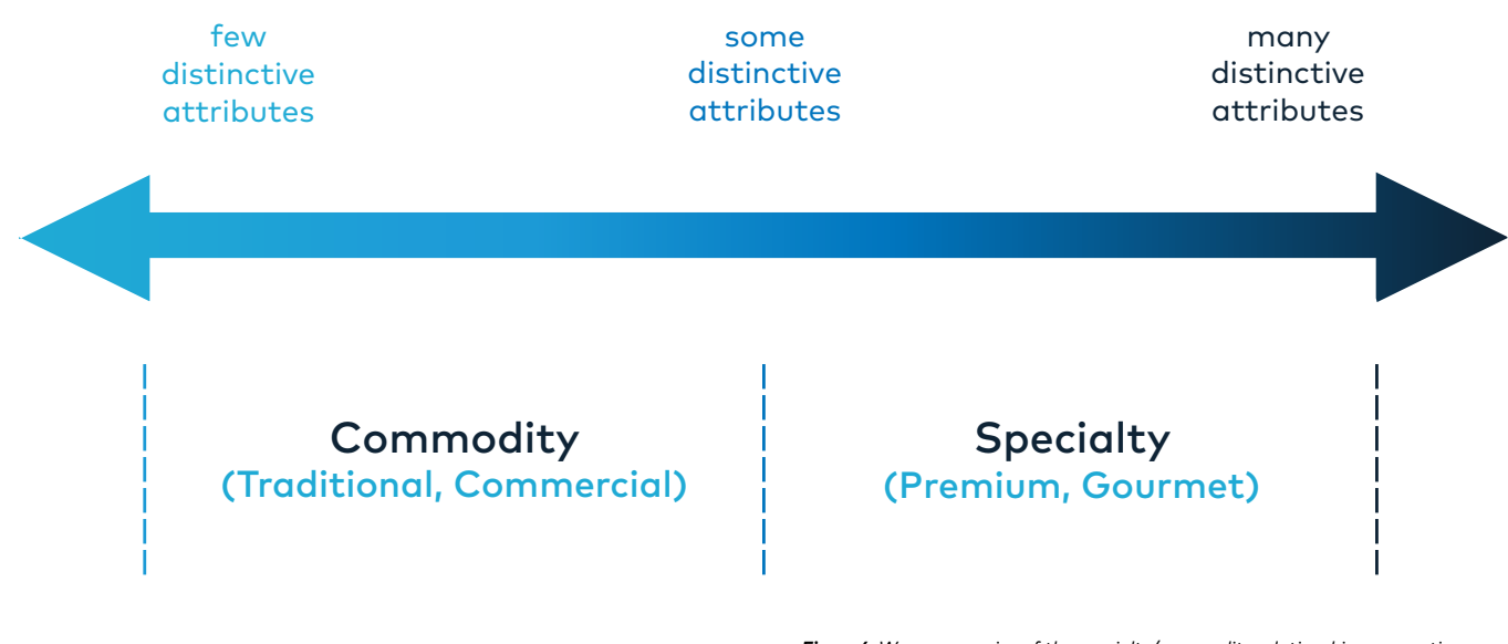
Figure 4: We can conceive of the specialty/commodity relationship as a continuum, with coffees becoming more "special" as they exhibit more distinctive attributes.

Because attributes can be quantified and measured, an attributes-based framework lends itself to scoring approaches, which are familiar in specialty coffee. However, instead of being limited to "quality" scores and defect counts, extrinsic attributes can be counted as well. This is a much more holistic approach to quality and value in the marketplace, and gives us a better idea of what drives value to consumers and producers alike. What this conception does not do, however, is prescribe a specific, narrow definition of "quality," which some specialty coffee advocates have sought in the past. An attribute that brings value in the marketplace is an attribute that lends specialness to the coffee, and "counts" towards its specialty status. This conception stands in contrast to an ideology of "it's what's in the cup that matters," since that approach devalues extrinsic attributes. What's in the cup matters, as does the cup itself, and the way the coffee got into the cup. It all counts-and can be counted.